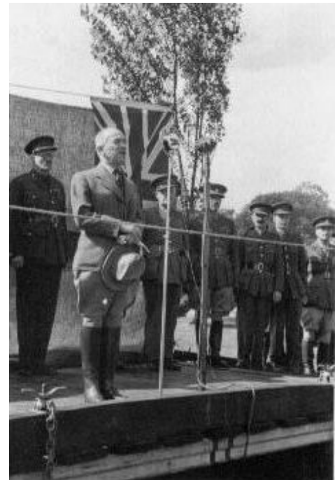
President Beneš addresses the troops Cholmondeley Park 26th July 1940